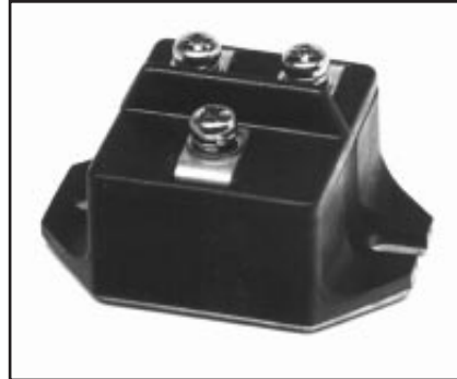
CN24__50, CD24__50, CC24__50 Fast Recovery Dual Diode Modules 50 Amperes/600-1200 Volts