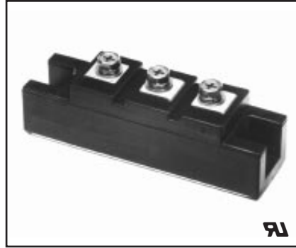
CD411230, CD411630 Dual Diode POW-R-BLOK™ Modules 30 Amperes/1200-1600 Volts