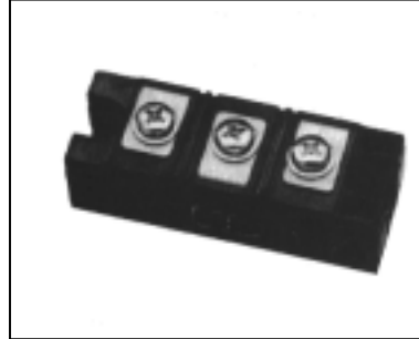
QR_3310001 Fast Recovery Diode Module 100 Amperes / 3300 Volts